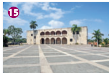
Alcázar de Colón The Columbus Palace was built (1511-1514) by Christopher Columbus's son Diego.