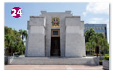
Parque Independencia Home to the Altar de la Patria, it is an important venue for public art exhibitions.