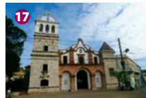
Iglesia de Santa Bárbara Though date of construction is unknown, estimates point to late 16th century. It was rebuilt after an earthquake in 1751.