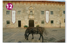
Museo de las Casas Reales From this 16th century stone building, Spain ruled its empire in the New World.