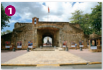
Puerta del Conde A national monument marking where the founders of the Republic proclaimed independence from Haiti in 1844.