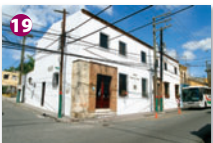
Museo del Ámbar Visitors can see samples of amber, the semi-precious gemstone the DR is known for.