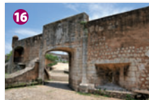
Puerta de San Diego Built in 1540, this was the original main gate to the city.