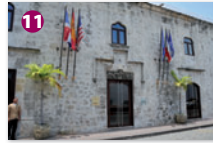
Hostal Nicolás de Ovando Once the home of SD's first governor, it was restored into a luxury hotel.