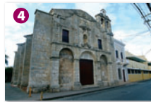
Iglesia Regina Angelorum The church houses the remains of Padre Billini, a 17th century priest.