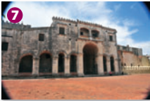
Catedral Primada de América The oldest cathedral in the Americas. Construction began in 1514 and was consecrated a cathedral in 1540.