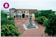
Parque Colón Located beside the Cathedral, this square is surrounded by interesting architecture. It is great for people watching.