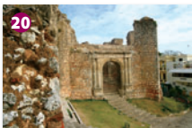
Ruinas Monasterio de San Francisco First monastery in the Americas when Franciscan monks arrived with SD's first governor Nicolas de Ovando in 1502.