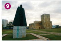
Fortaleza Ozama The oldest military plaza in the Americas, used as a garrison and prison well into the 1960s.