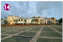
Plaza de España Once the center of colonial power and trade. It is today a large romantic plaza replete with restaurants and bars.