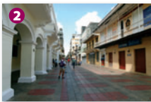
Calle El Conde This pedestrian mall is popular with locals and visitors for its bustling atmosphere. Many shops now cater to tourists.