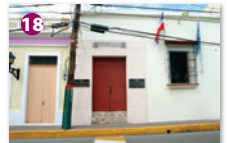
Museo Casa de Duarte Once the house of Juan Pablo Duarte, the country's founding father.