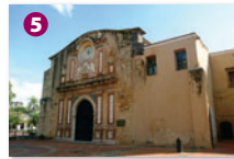
Convento de los Dominicos Built in 1510, the convent was the site of the New World's first university, Santo Tomas de Aquino.