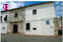
Casa del Cordón Completed in 1504, this is the oldest stone house in the Americas, originally owned by Francisco de Garay.