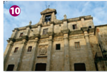
Panteón Nacional Built from 1714-1745. In 1956 it was converted to the National Pantheon.