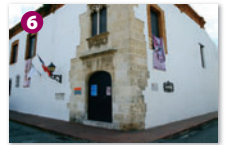
Casa de Tostado Built around 1520 for Francisco Tostado. The house is now a museum that displays Dominican wealth in the 19th century.