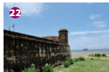
Fuerte de San Gil Built in 1543, this was the original gate of the city's western wall. Ramon Matias Mella fired the first shot here prior to proclaiming independence from Haiti.