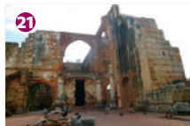
Hospital Nicolás de Bari The ruins of the first hospital in the New World. It was constructed in 1503 by order of Santo Domingo's first governor, Nicolás de Ovando.