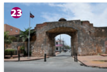
Puerta de la Misericordia The Gate of Mercy. Built in 1543, this was the original gate of the city's western wall.